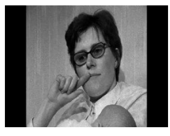
Picture 24 Première chaîne,"Les femmes...aussi: Le prix du deuxième," February 11 1970.

Finally she says that she had not taken account of the fact that she would lose her benefits when