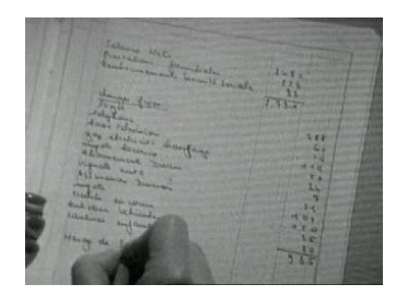
Picture 6-7 Troisième Chaîne, "Vie pratique: Savoir tenir son budget", April 1 1974

This account book was a tool for rationalising expenditure that had, since the interwar period, been widely distributed by home economics schools and by social assistance institutions who wished to ensure that child and housing benefits were put to proper use [picture 8].6 Such institutions employed "housekeeping advisors" (home economics specialists) who worked in social centres on the new