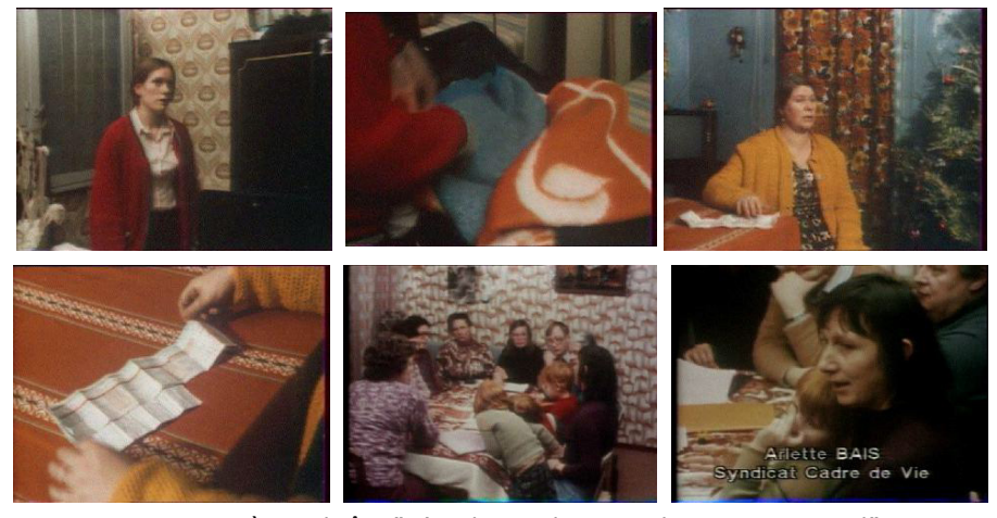
Picture 34-37 Deuxième Chaîne, "C'est la vie: loyer et charges Argenteuil", January 10 1980. Picture 38-39 Deuxième Chaîne, "C'est la vie", deuxième chaîne, January 1 1980.

In 1980 in Argenteuil a woman lays four blankets over her baby in her pram [pictures 34-35]. She pays a huge amount for heating but their building is very damp. Another resident, member of the tenants association, is filmed with a bill in her hand; she explains that they have decided to block payment of amenity charges [pictures 36-37] (Deuxième Chaîne, "C'est la vie: loyer et charges Argenteuil", January 10 1980). There are several reports monitoring these avenues of protest.