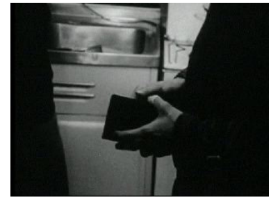
Picture 20–21 Première chaîne, "Les femmes...aussi: Micheline, 6 enfants, rue des Jonquilles", April 24 1967