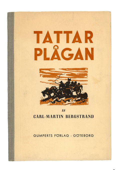
Fig. 3 The title page of Carl-Martin Bergstrand's Tattarplågan from 1942.

This title was one of Bergstrand's contributions to an ongoing public political debate referred to as the "tattare question". Topics discussed in the book are: "The 'Tattare' Problem through History", "Occupations and Means of Earning a Living", "Witchcraft", "Morality" and "Social Measurements" (often violent interventions by locals against "tattare" families). In the chapters, Bergstrand describes the content of the narratives connected to each theme, but also adds comments about them. The material on local interventions is described as "anything but edifying" and "shocking" (1942: 108). In other parts of the text he describes widely spread stereotypes of "tattare" without comment.