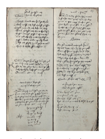
Fig 1. The middle section on the right page is the entry in Stockholm Municipal Court Records from 1512 that mentions a travelling group of people called "tatra" (in modern Swedish "tattare"). Translation into a modernized language: